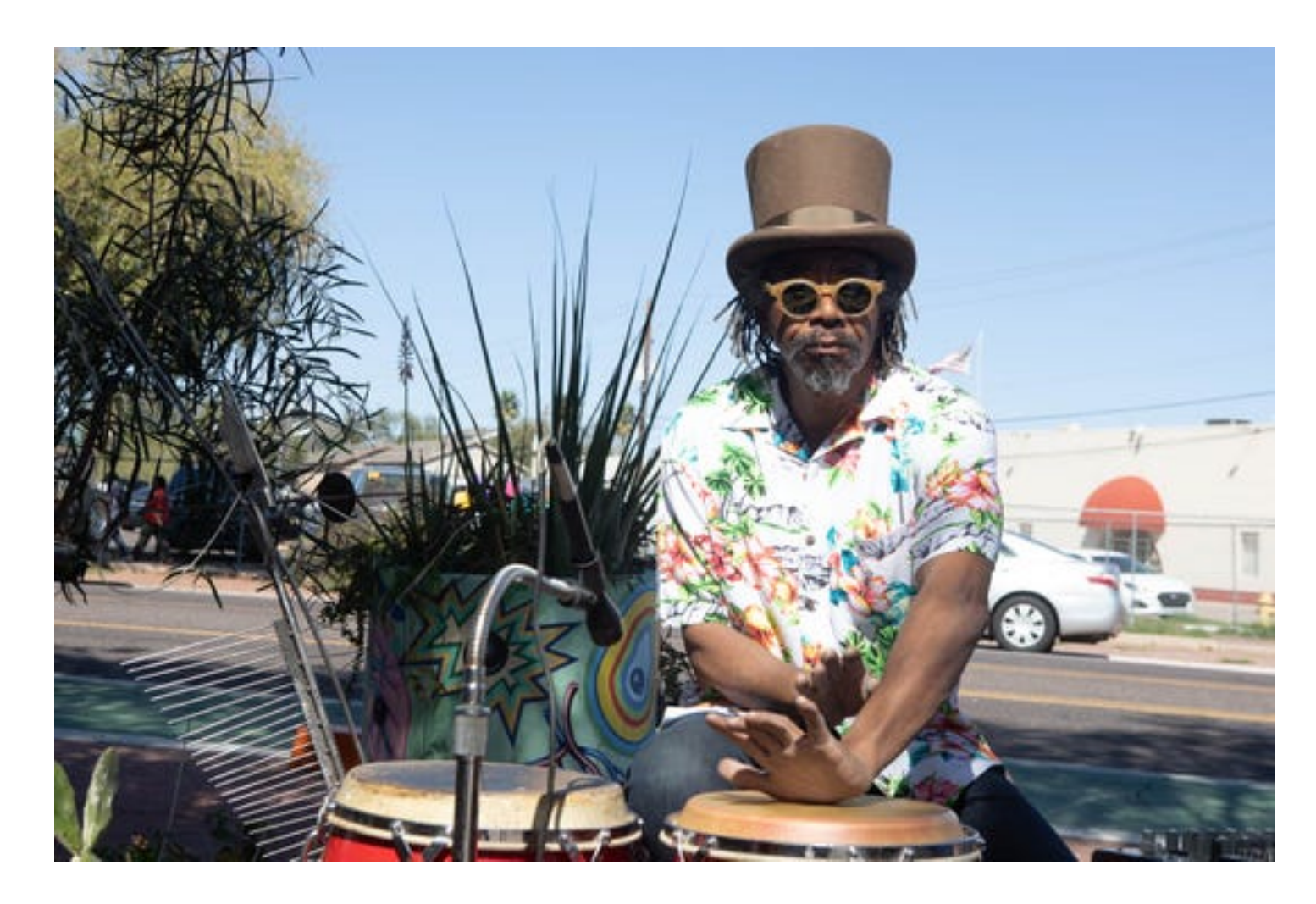
A musician provides percussion on Grand Avenue in Phoenix on March 16, 2019, during Art Detour.

56. Attend a poetry slam. They're hosted regularly by Phoenix Poetry Slam (https://www.facebook.com/pg/PhoenixPoetrySlam).